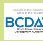
Bases Conversion and Development Authority (BCDA)