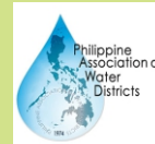
Philippine Association of Water Districts (PAWD)